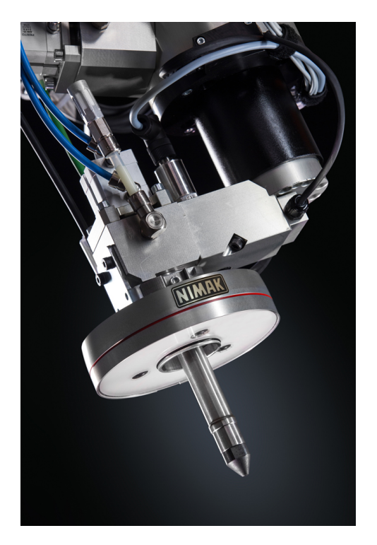
Fig. 2: With the gluing technology business unit, NIMAK has prepared itself in good time for the increasing importance of these applications. The "a.tron" application technology for adhesives, sealants and insulating materials covers the entire system with all components, which are perfectly matched to each other.