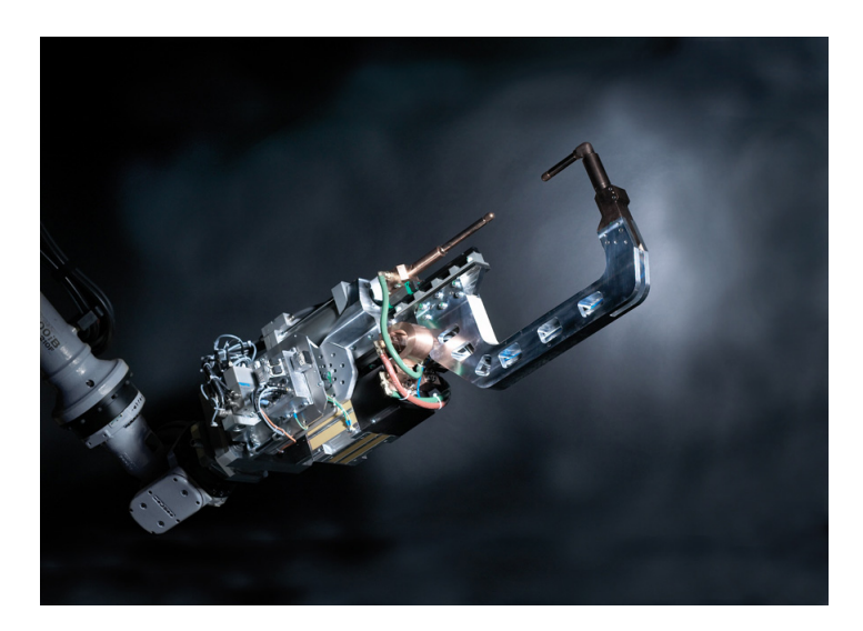
Fig. 3: NIMAK put the first robot gun on the market in 1977. The company has been the largest German manufacturer in this sector for a long time and has established itself as an innovation leader.